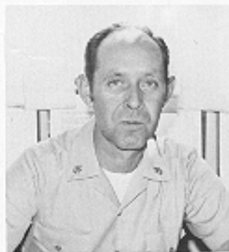
HTC N. PREMO Fire Department