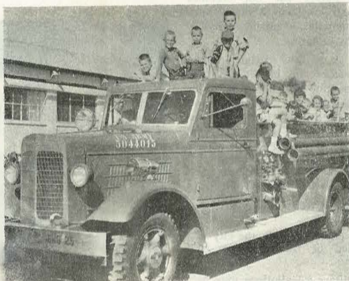
CLIMB ABOARD — Youngsters at Kagnew are treated with a ride on the Kagnew fire truck. This activity was one of the special features of «Organization Day» which was observed 16 September.

William Tubman, President of Liberia, called the Peace Corps cont. p. 4 col. 1